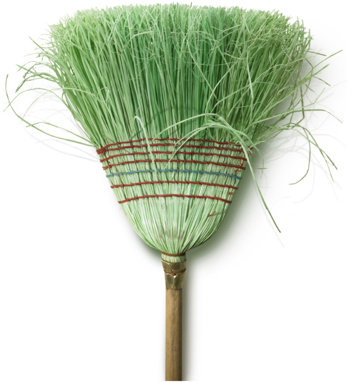
Chuck Ramirez, Brooms_ Escoba Verde, 2007, Pigment Inkjet Print, 24.5 x 20 in, 62.2 x 50.8 cm, Edition of 6