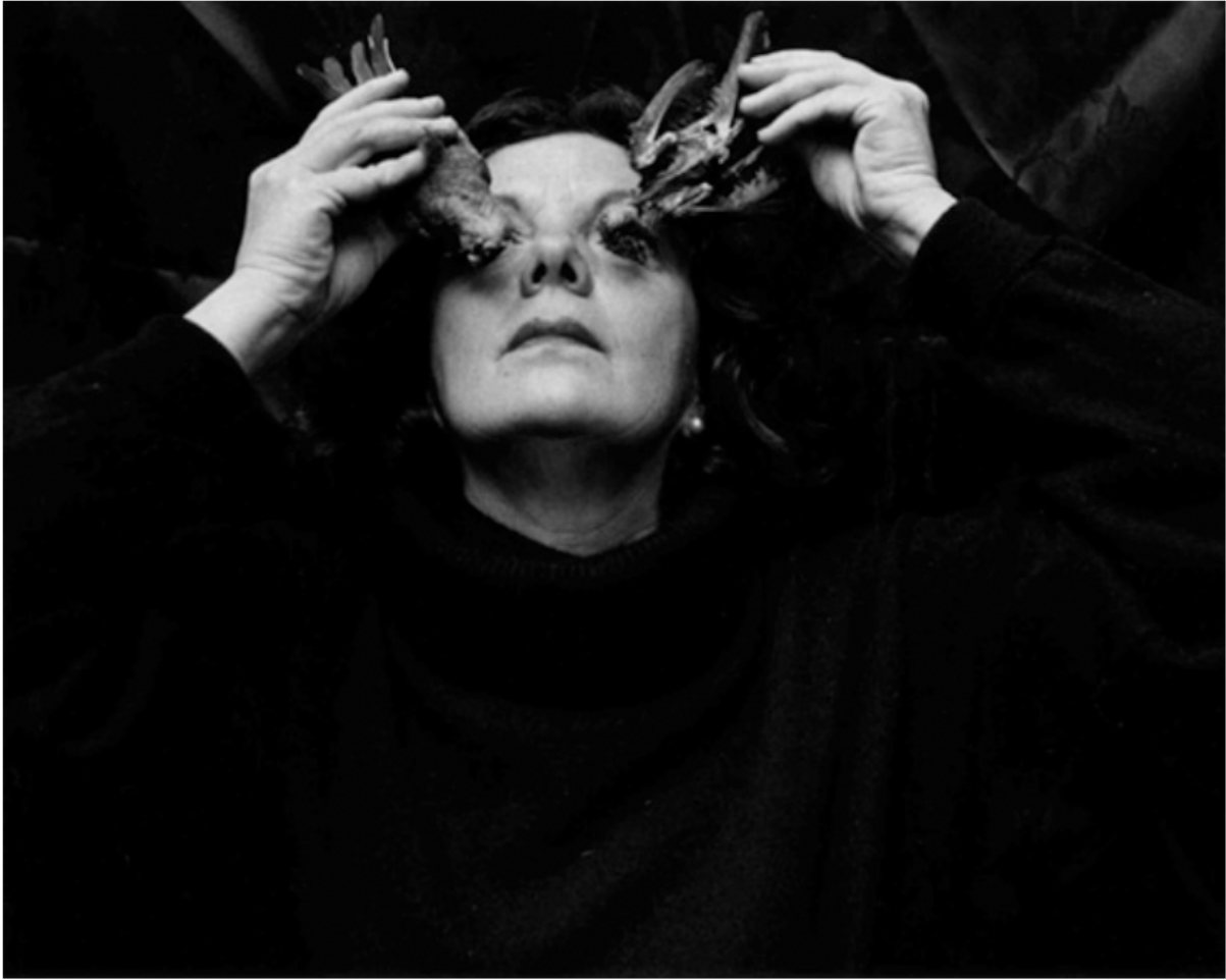
Graciela Iturbide, Eyes to Fly With , Coyoacán, Mexico, 1991, Silver Gelatin Print, 14 x 11 in, 35.6 x 27.9 cm