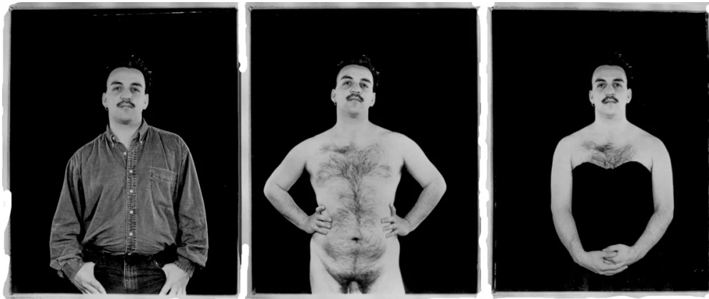
Laura Aguilar, Clothed/Un clothed #20, 1992.

These acquisitions may be a good barometer to track the success that Latinx art (used here to describe artists based in the United States, primarily but not limited to those born here or having arrived as children, with a heritage to Latin America and the Caribbean) is currently having within the art world. The fight for recognition has been ongoing since it was initiated in the late 1960s by artists, activists, and curators, and right now presents what some might call a moment for Latinx art. Characterizing it as a moment is problematic, however, as that would make it seem like a fleeting trend. It would also dismiss the fact that Latinx people have been an important part of this country and will continue to be as the Latinx population in this country continues to grow. (In 2020, Latinxs accounted for 19 percent of the U.S. population, up from 5 percent in 1970.)