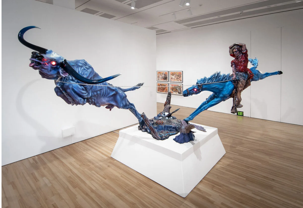
Installation view of "Border Vision: Luis Jiménez's Southwest," 2021-22, at Blanton Museum of Art, Austin.

Ferrer's Latinx Photography in the United States: A Visual History , both of which detail early photographic contributions by Latinx artists.