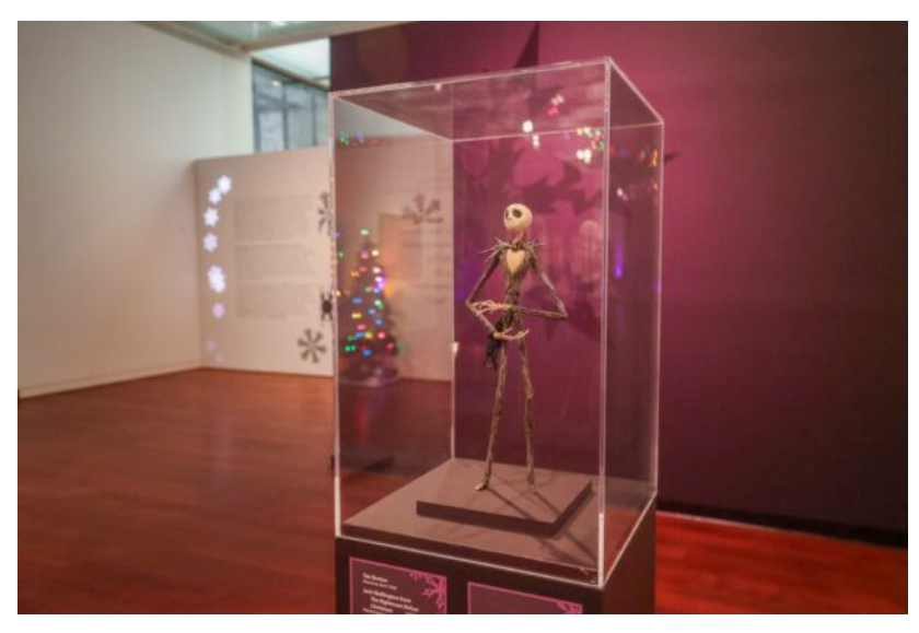
"Dreamland | Tim Burton's The Nightmare Before Christmas" on vie

Click these links to learn about all current and upcoming Austin-area exhibitions.