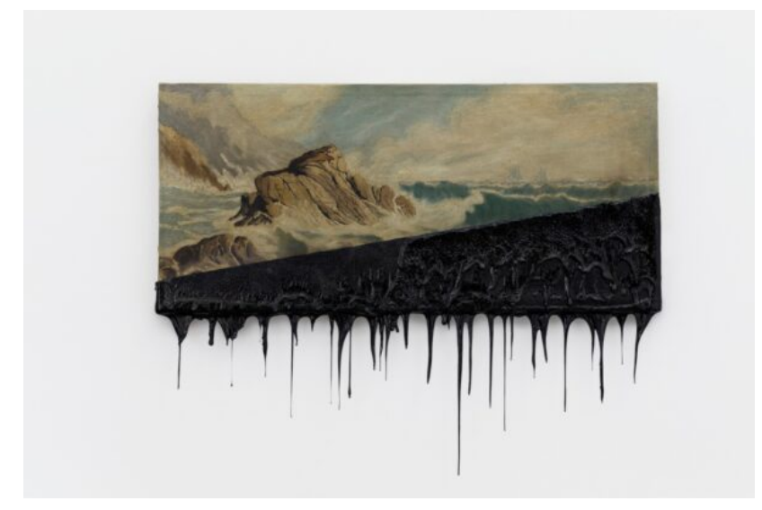
Minerva Cuevas, "Horizon II," 2016, oil on canvas dipped in chapopote, 21.65 x 27.95 x 1.97 inches. Artwork © Minerva Cuevas.

Unbreakable: Feminist Visions from the Gilberto Cárdenas and Dolores Garcia Collection will be on view at the Blanton through Sunday, December 3, 2023.