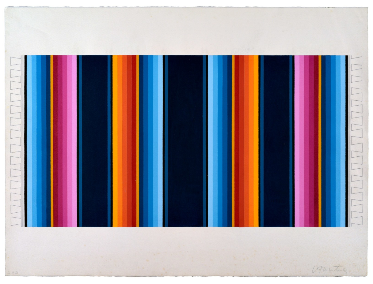
César A. Martínez, Serape: 16 Mar 1980 , Acrylic and graphite on paper, 22.25 x 30 in., 56.51 x 76.2 cm

The Museum of Modern Art New York, New York