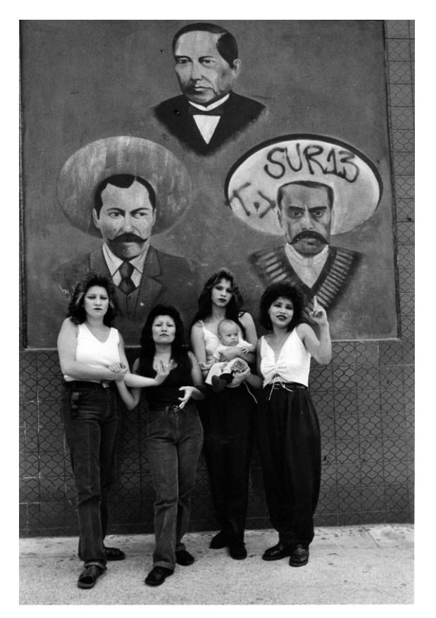
AltaMed Art Collection Los Angeles, California

Graciela Iturbide, Cholas I (con Zapata y Villa) White Fence, East L.A. , 1986, Signed by the artist in ink on recto, Silver Gelatin Print 20 x 16 in., 50.8 x 40.6 cm