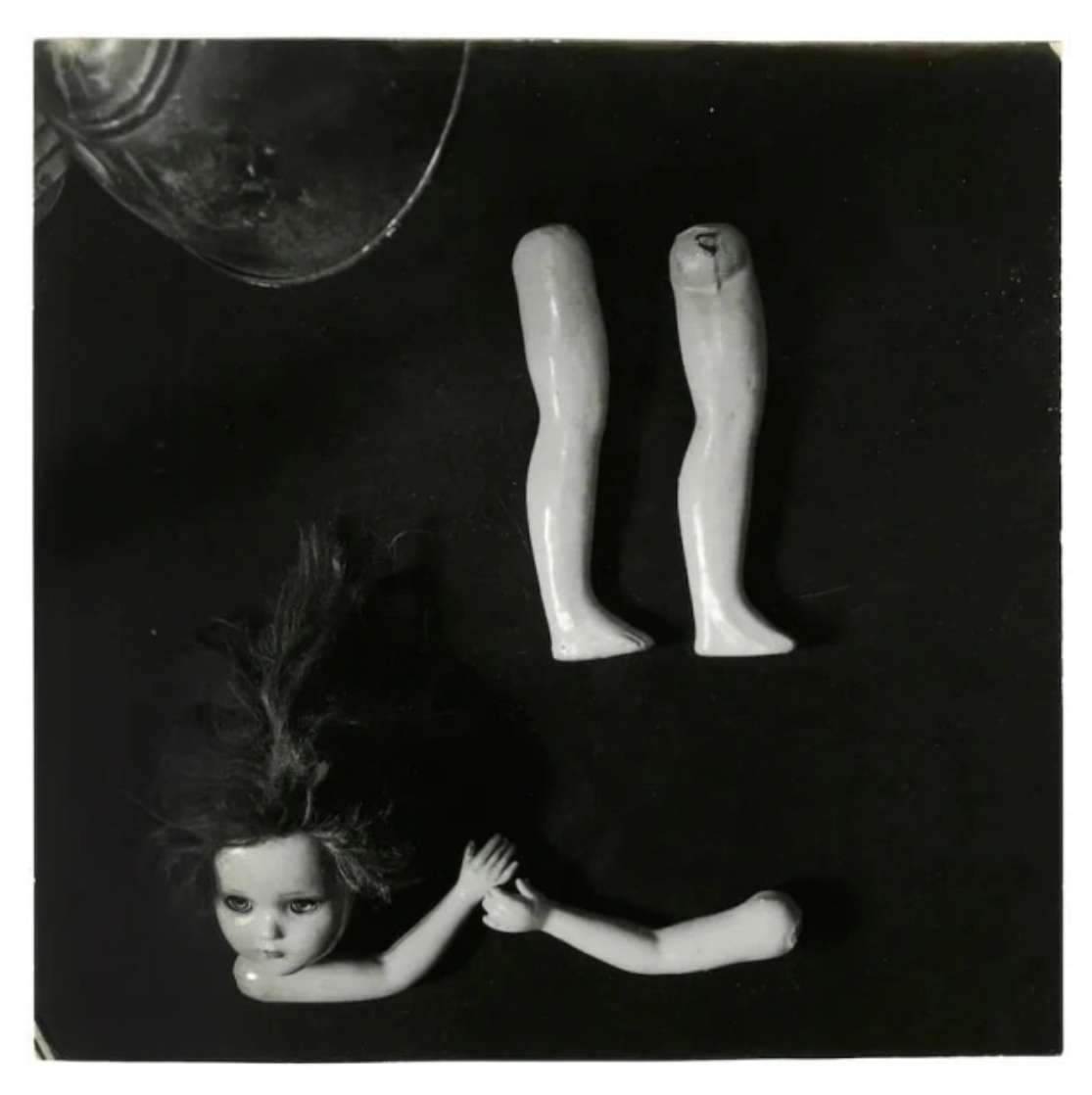
Kati Horna, Untitled, Mexico , 1949/1960, Signed on verso in pencil, gelatin silver print (Photomontage), 8.10 8 in., 20.6 x 20.3 cm.