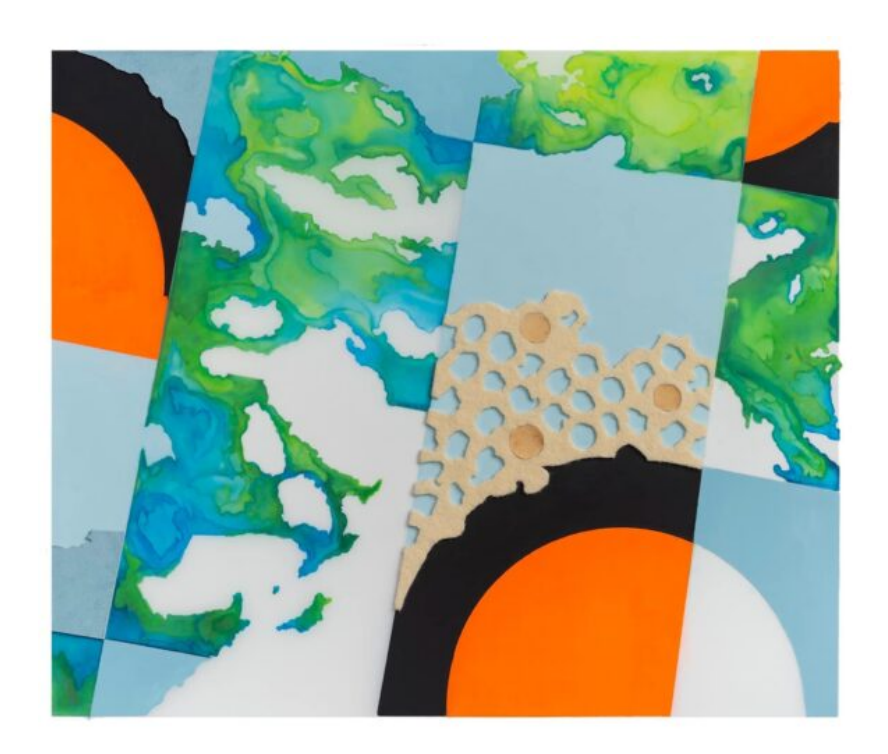
Constance Lowe, "Drift Threshold #5, (Tapioca Tundra)," 2023, acrylic paint and ink, wool felt, and leather on drafting film, 19.5 x 23 inches

Glasstire counts down the top five art events in Texas.