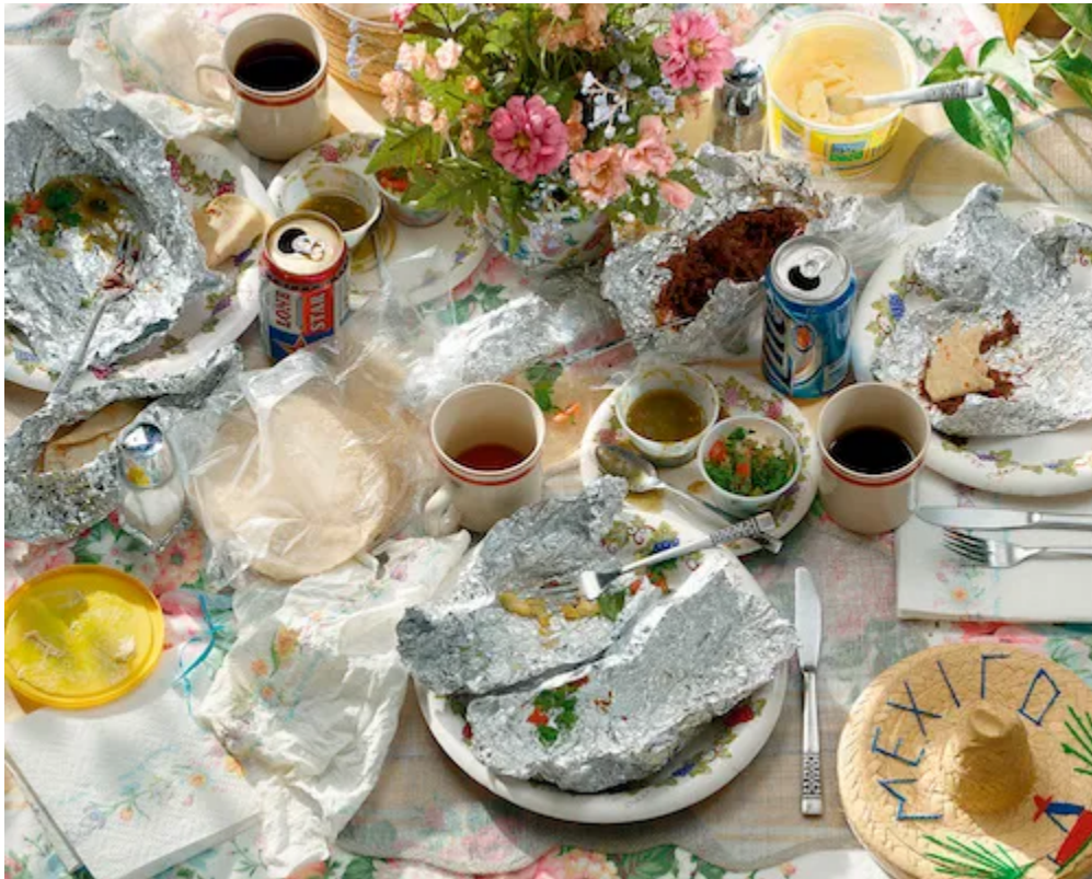
"Breakfast Tacos" from the series Seven Days (2003) by Chuck Ramirez.

Muñoz, who often works in platinum developments, captures the sensuous movement of dancers in costumes from around the globe. Prieto's work, on the other hand, tends to focus more on film and literature, and the artist's travels in Latin America.