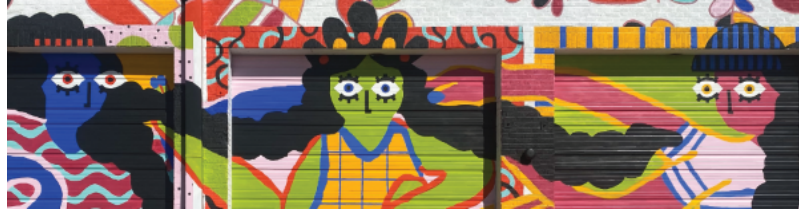
A work by Her.Mosa Collective, South Texas College