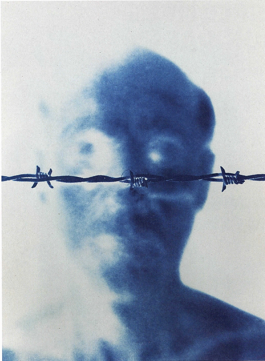
Jan Van Leeuwen, Barbed Wire No. 5 , 1993, cyanotype, 16 x 12 inches, image courtesy of the artist and PDNB Gallery.