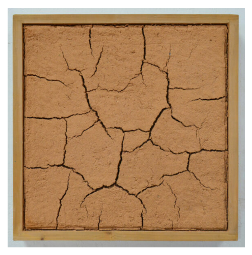
Frank Romero, "Adobe Series – Tierra roja, Set 2," 1995/2024, soil, acrylic, chicken wire on wood, 24 x 24 x 2.5 inches

Even as the gallery hummed with the vibrant coloration and provocative symbology of Romero's paintings, works on paper, tableau, and sculptures, one quiet corner stood out. A quatrain of plain brownish two-foot squares hung two-by-two, recreated examples of The Adobe Series from 1995. Romero found a second New Mexico home alongside other L.A. artists and built his own adobe home with the guidance of Taos Pueblo residents, learning deeply-rooted craft traditions. The relatively diminutive Adobe Series works represent a depth of inquiry on artistic, artisanal, and sociopolitical life, resolutely separated in mainstream capitalist culture but for millennia seen as intrinsically interconnected in the Indigenous cultures that undergird Chicano consciousness.