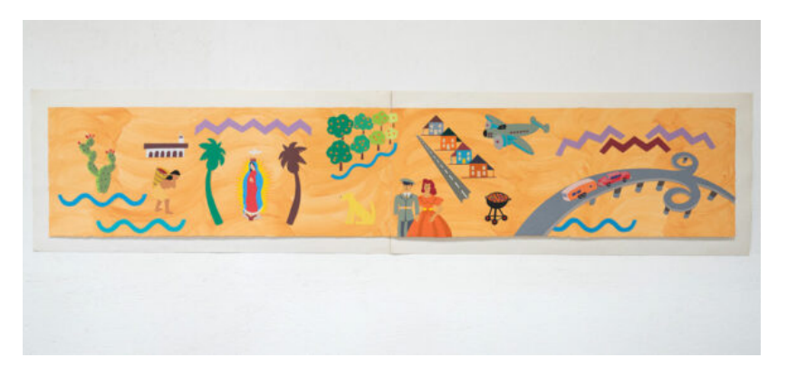
Frank Romero, "Recuerdo (design for reflection pool Warner Center, LA)," 1982, acrylic and cut paper collage, 15 1/8 × 80 inches

fashioning of Aztlán, the mythic homeland of Indigenous Americans ranging from what is now the Southwestern U.S., a land and nomenclature of present-day Latin Americans calling forth an originary identity long predating "minority" or second-world status. Romero's work, dated 1982 and recreated here, sets toylike figures and objects in a sandbox setting, recalling childhood play while also suggesting that all that can be built can be wiped away in moments, the sandbox reset for the next world-shaping session. Most poignant are little ceramic blocks of the Aztec creator deity Quetzalcoatl built in the shape of a pyramid, representing both the glory of empire and its downfall.