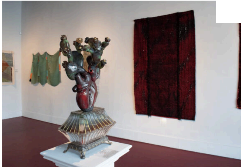
Installation view of “Threading Glass.”

The present exhibition brings together a large body of Princes’ Poster works on canvas and on paper, created between 2014 and 2024. The large canvases show reproductions of advertisements for mailorder posters, as were often found at the back of magazines in the second half of the 20th century. Hugely popular at the time, these printed images represent touchstones of early counter-cultural magazines, which are among Princes’ long-term interests. The motifs of political slogans and far-out art in the form of cheap posters are singled out and chosen by the artist.”