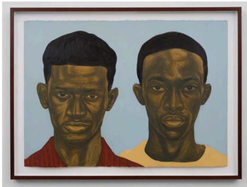
Collins Obijiaku, "Chima and Abatti," 2025, oil and charcoal on paper, 30 x 40 inches