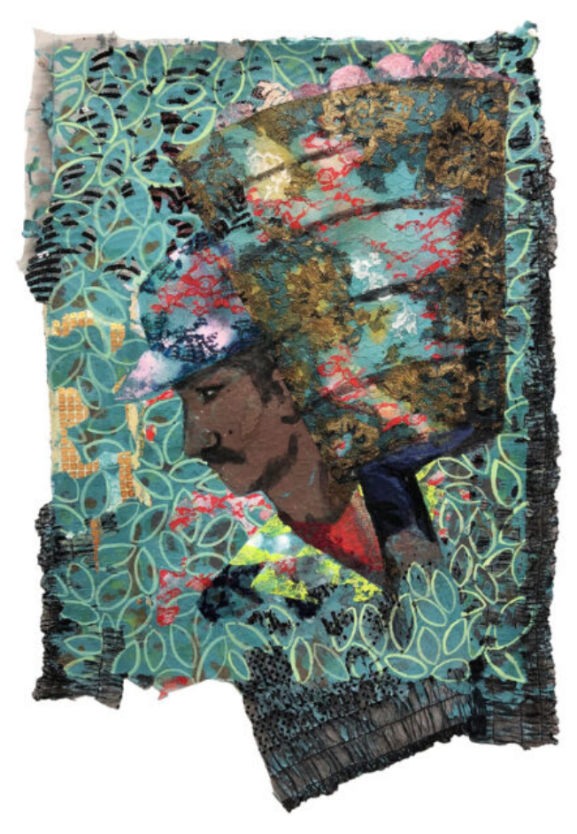
Lina Puerta, "Crop Laborer Green," 2018, handmade paper composed of pigmented cotton and linen paper pulp, embedded with sequined fabrics, lace, and finished with gouache, 29 x 20 inches