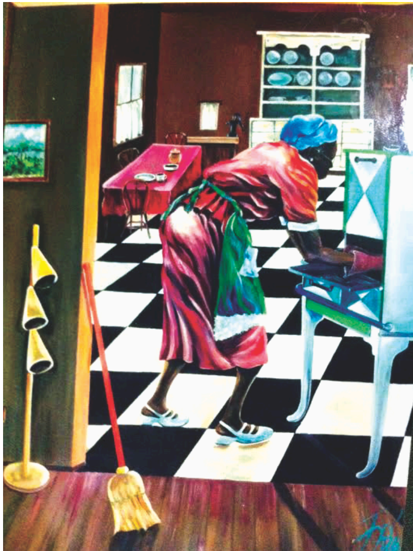
Glen Franklin, Grandma's Kitchen (from "Not So Invisible 7%: San Antonio's Peoples of African Descent")