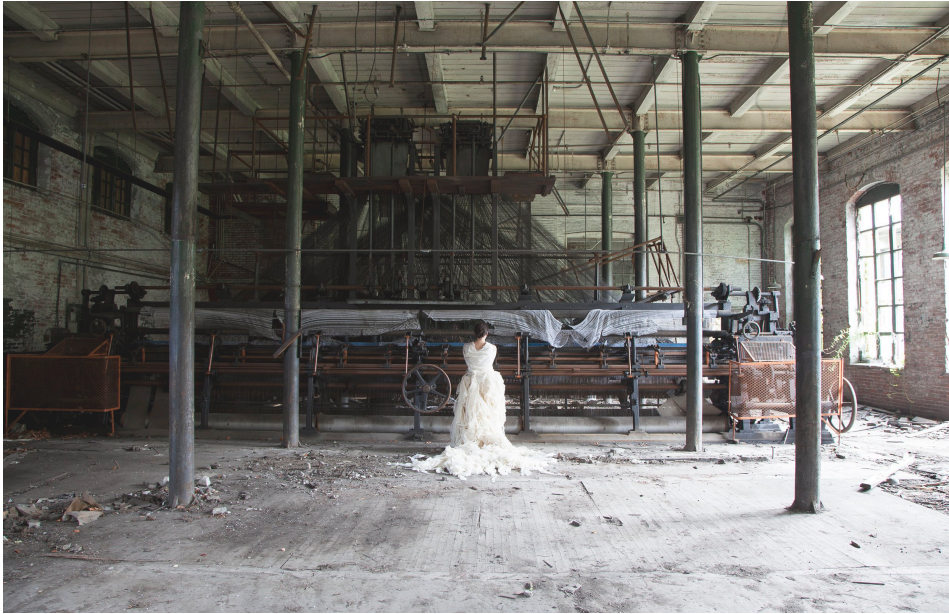
Weaver with Plant

The Witness extends the thought. Columns march toward a bright vanishing point. The ceiling is an atlas of pipes and flaking panels. Tiles are scattered like old shingles across the floor. In the middle distance a body stands small and steady. The ruin does not overwhelm. It is measured by a gaze that will not look away.