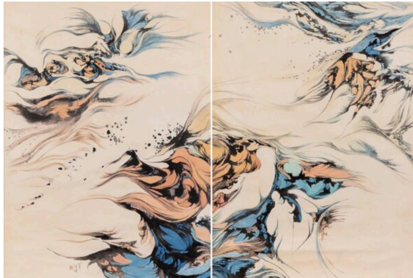
Hung Hsien, "Floating without End" 1970. Diptych, ink and color on paper.