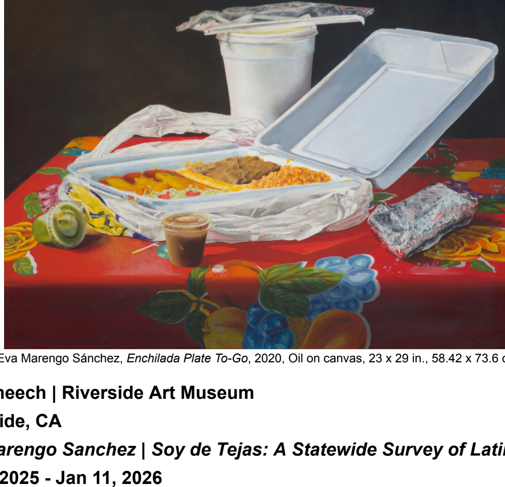
Eva Marengo Sánchez, Enchilada Plate To-Go , 2020, Oil on canvas, 23 x 29 in., 58.42 x 73.6 cm