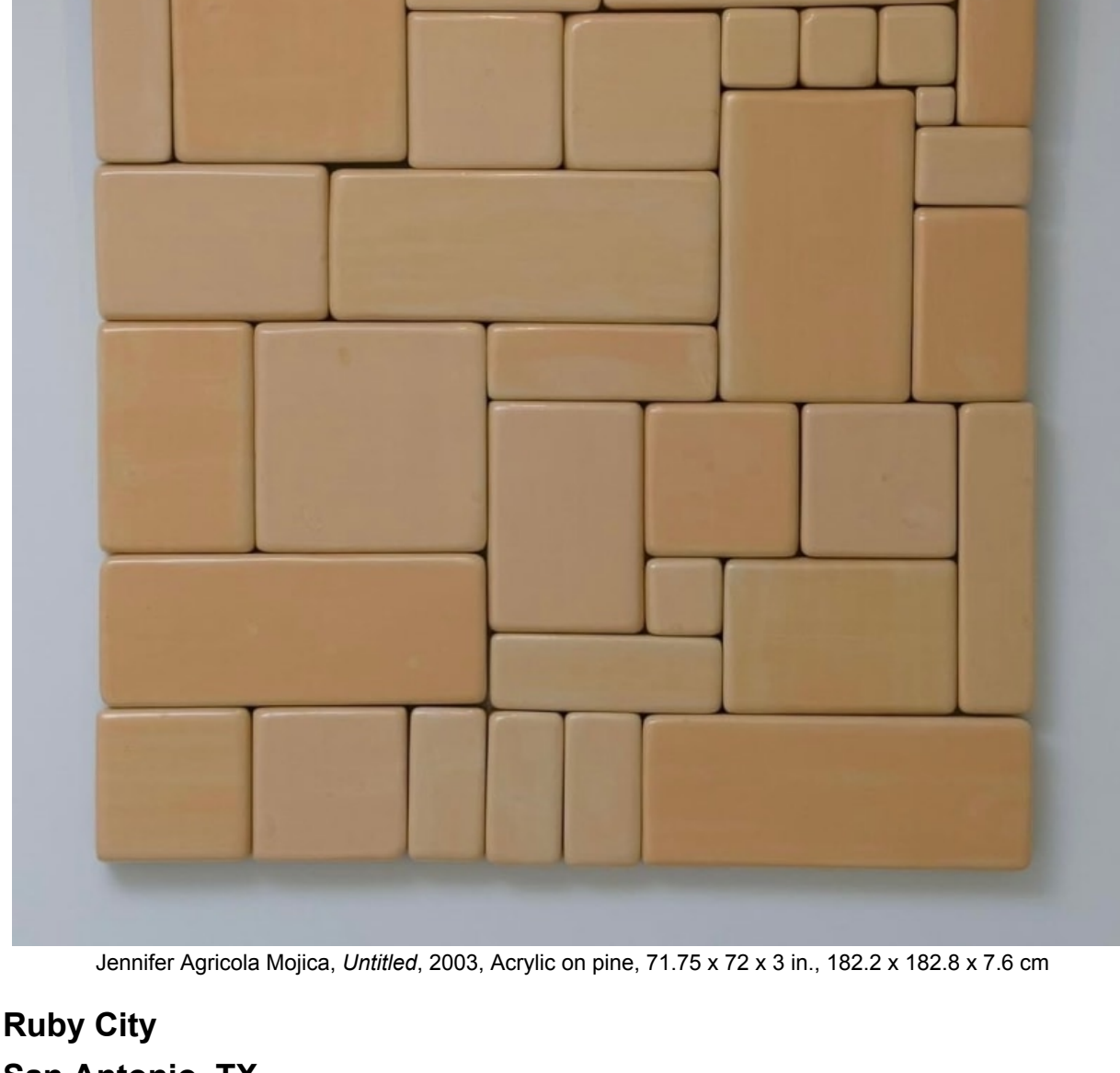
Jennifer Agrícola Mojica, Untitled , 2003, Acrylic on pine, 71.75 x 72 x 3 in., 182.2 x 182.8 x 7.6 cm