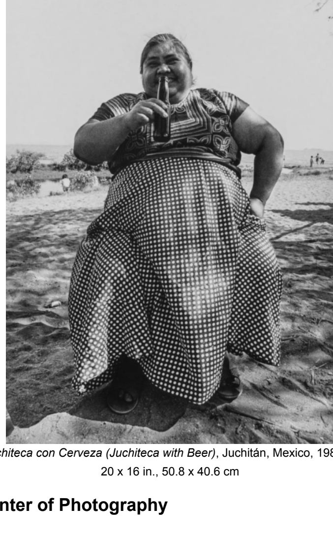
Graciela Iturbide, Juchiteca con Cerveza (Juchiteca with Beer) , Juchitán, Mexico, 1984, Gelatin Silver Print, 20 x 16 in., 50.8 x 40.8 cm