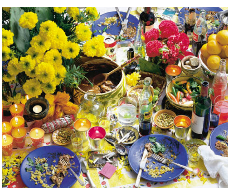
Chuck Ramirez, Seven Days: Dia de los Muertos , 2003, 2024, Pigment Ink Print on Canson Platine paper, 48 x 60 in., 121.9 x 152.4 cm, Edition of 6

Amon Carter Museum of American Art, Fort Worth, TX