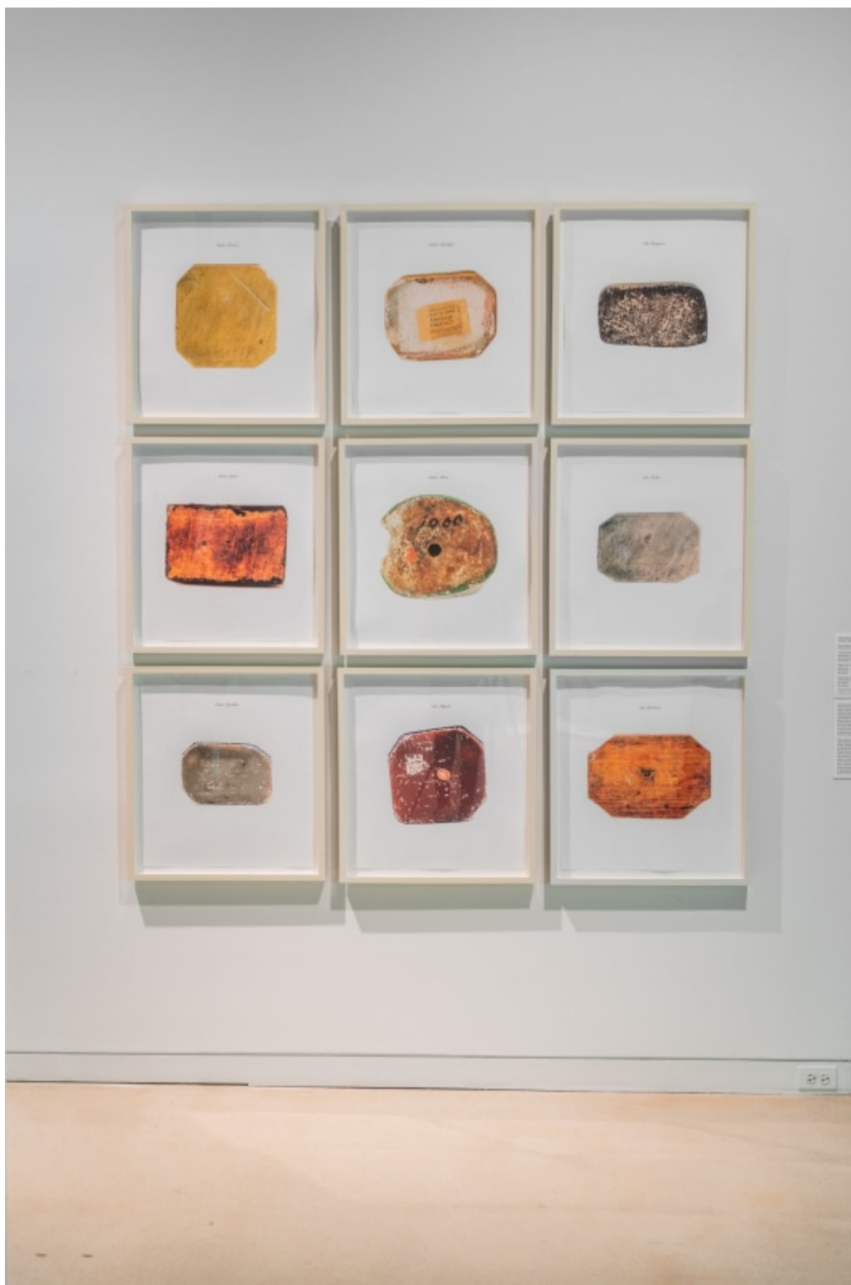
Installation View, Chuck Ramirez, Santos series, 1996. Readymade Remix exhibition, Courtesy San Antonio Museum of Art, Photography by Beth Devillier, 2025

San Antonio Museum of Art, San Antonio, TX