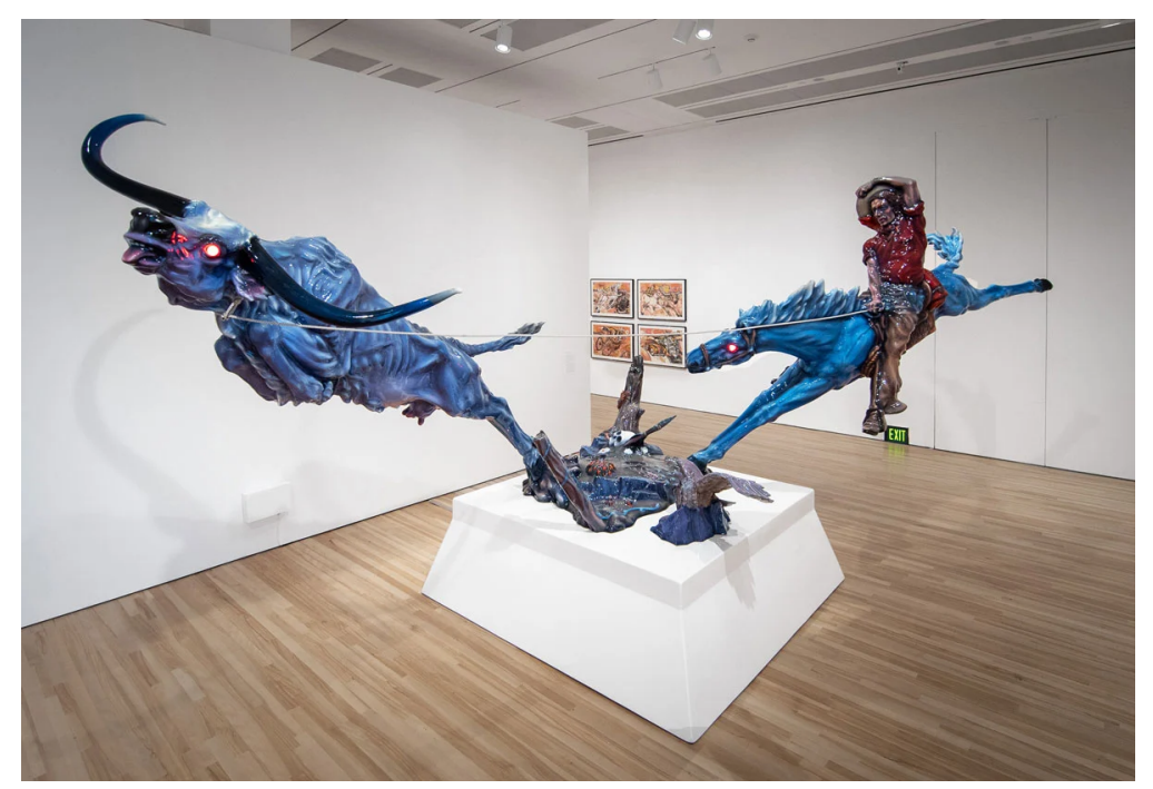
Installation view of "Border Vision: Luis Jiménez's Southwest," 2021–22, at Blanton Museum of Art, Austin.

Ferrer's Latinx Photography in the United States: A Visual History , both of which detail early photographic contributions by Latinx artists.